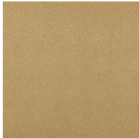
Jazz Gold - 29